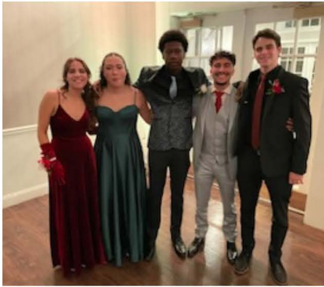
The cast of the murder mystery.